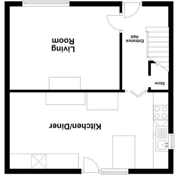
Ground Floor Approx. 41.4 sq. metres (445.4 sq. feet)