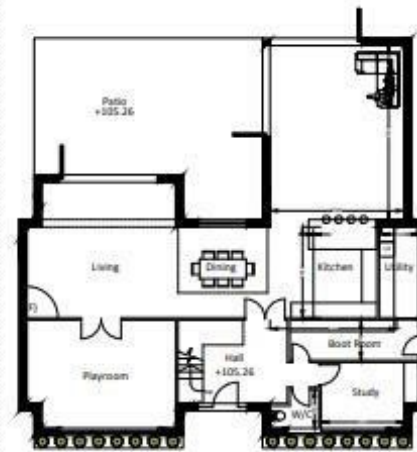
Proposed Ground Floor