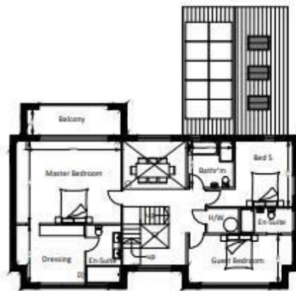
Proposed First Floor 1:100