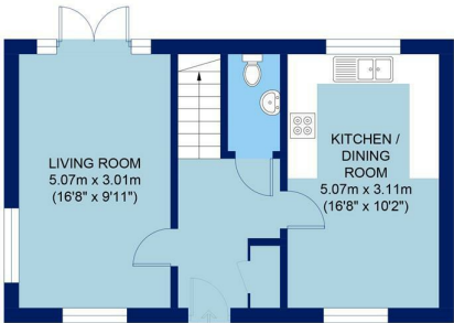
IN GROUND FLOOR GROSS INTERNAL FLOOR AREA 467 SQ FT