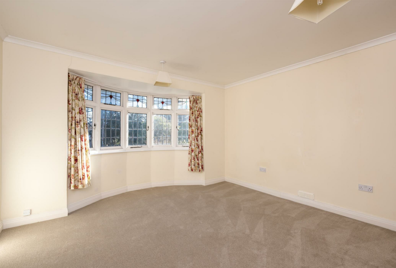
Bedroom 3 WC.. Bathroom Garden