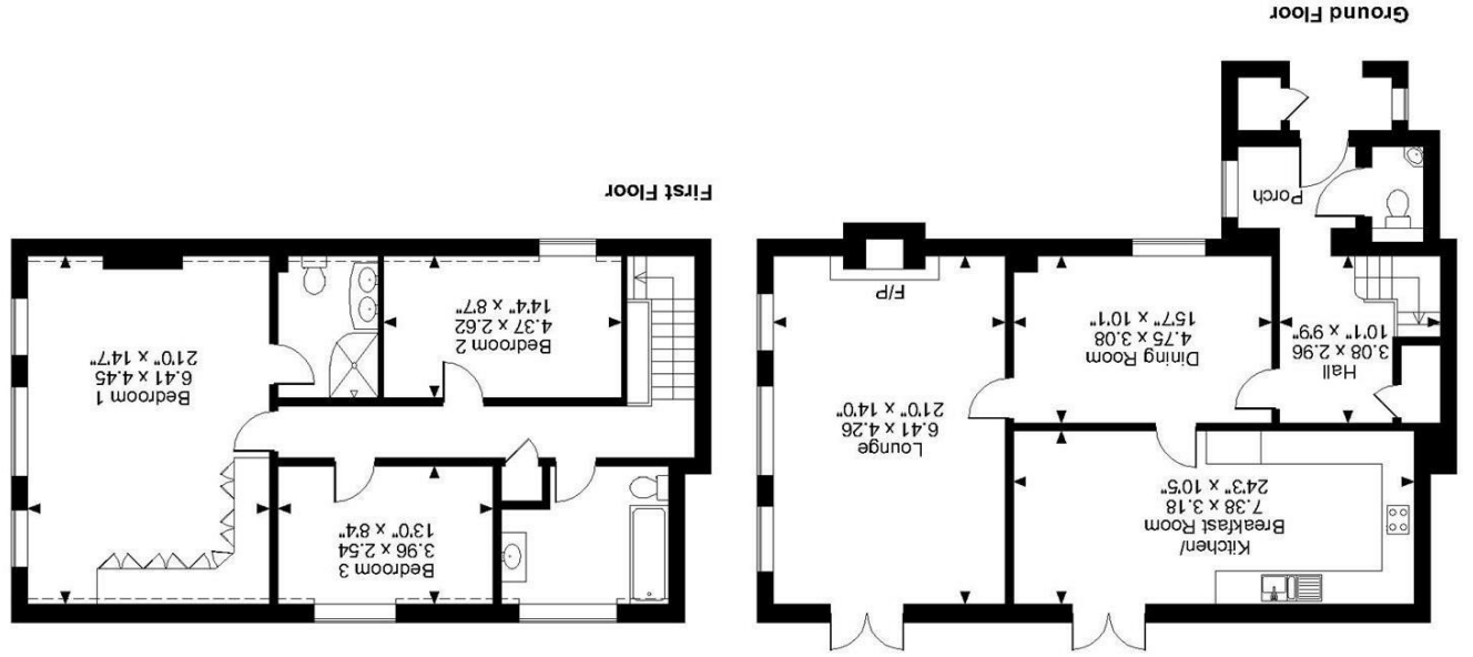
Earlswood Mews, Davenham Internal area 1,692 sq ft (157 sq m) Quoted Area Excludes External C/B.