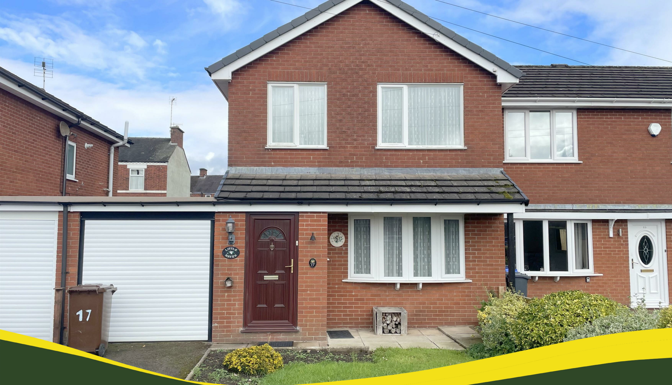
Little Haven, 17 Milk Street Leek