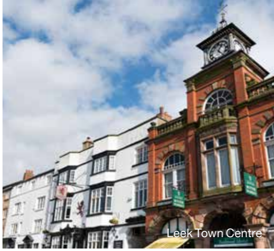
Leek Town Centre

A vibrant community in the heart of Leek