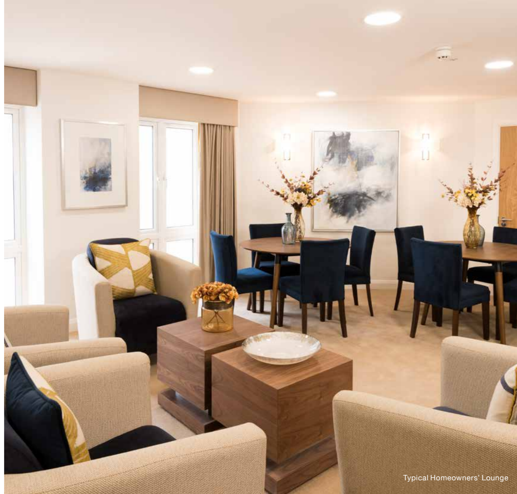
Typical Homeowners' Lounge

Enjoy more time to socialise with the people you care about