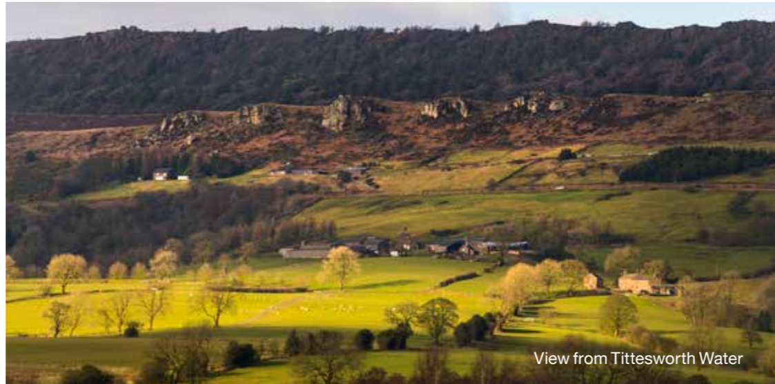
View from Tittesworth Water