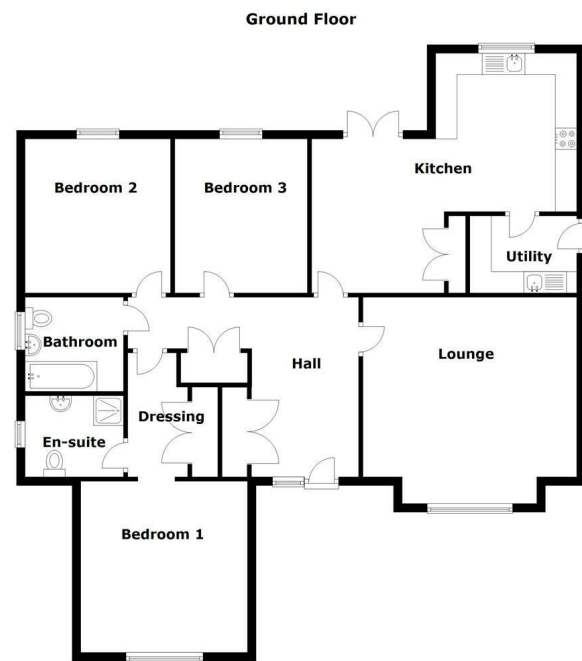
Floorplans are for illustrative purposes only, are not to scale and should be viewed with this in mind. Whilst every attempt is made to ensure accuracy, all measurements, positioning, fixtures, fittings and any other data shown are an approximate interpretation. Plan produced using PlanUp.