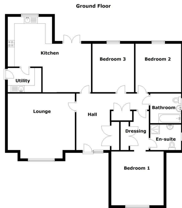
Floorplans are for illustrative purposes only, are not to scale and should be viewed with this in mind. Whilst every attempt is made to ensure accuracy, all measurements, positioning, fixtures, fittings and any other data shown are an approximate interpretation. Plan produced using Planitip.