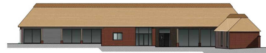
PLOT 1 – photo and floorplan