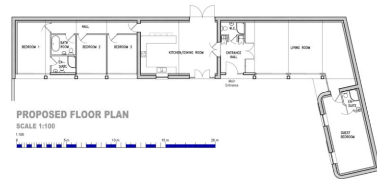
PROPOSED FLOOR PLAN