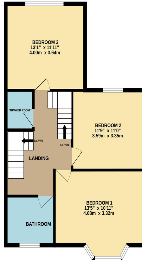
1ST FLOOR 649 sq.ft. (60.3 sq.m.) approx.