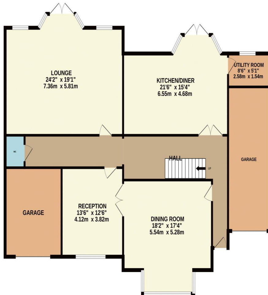
GROUND FLOOR 1838 sq.ft. (170.7 sq.m.) approx.