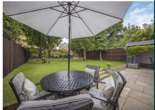
Old Forge Way

Approximate Gross Internal Area Ground Floor = 68.9 sq m / 742 sq ft First Floor = 49.0 sq m / 527 sq ft Garage = 9.7 sq m / 105 sq ft Total = 127.6 sq m / 1374 sq ft