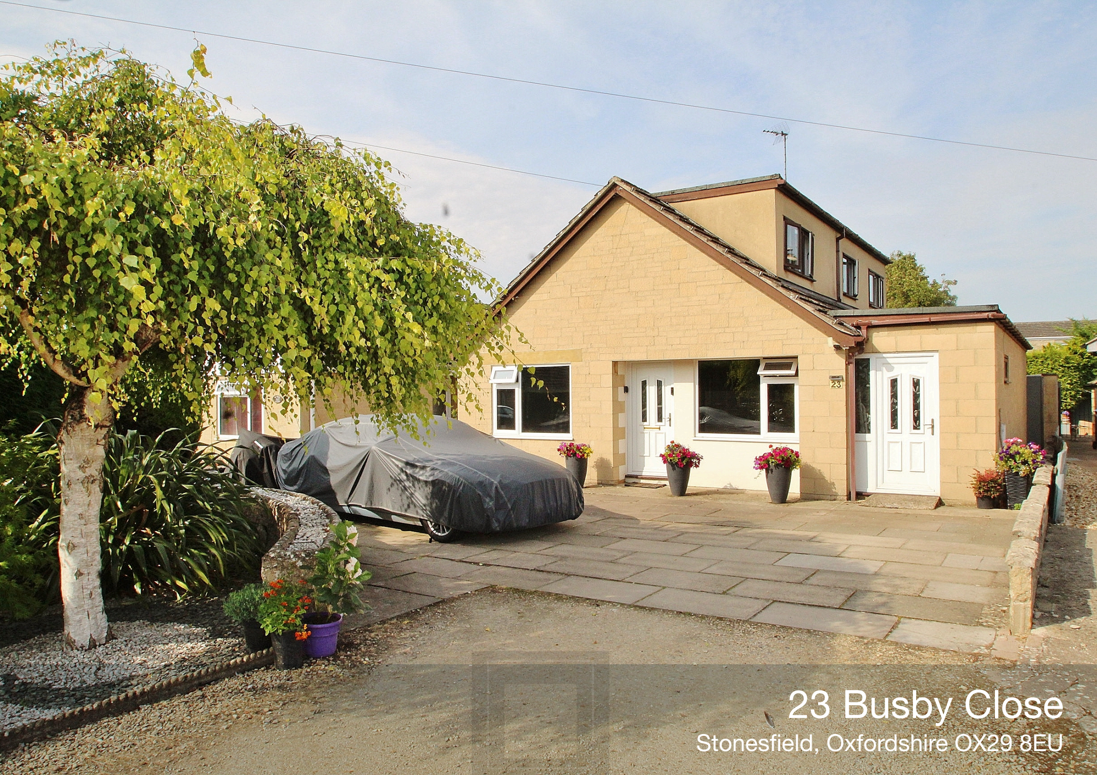
23 Busby Close Stonesfield, Oxfordshire OX29 8EU