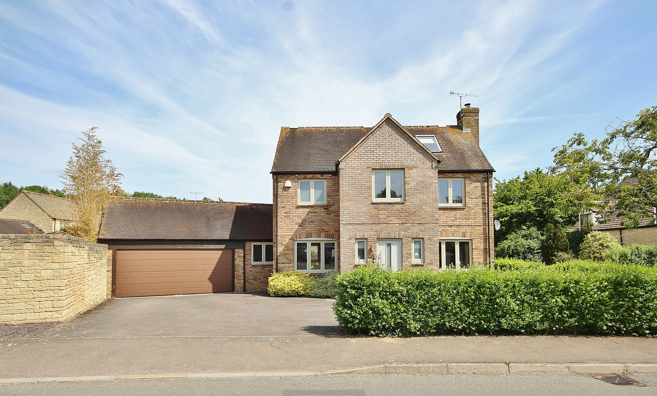
46 Valence Crescent Witney, Oxfordshire OX28 5FT