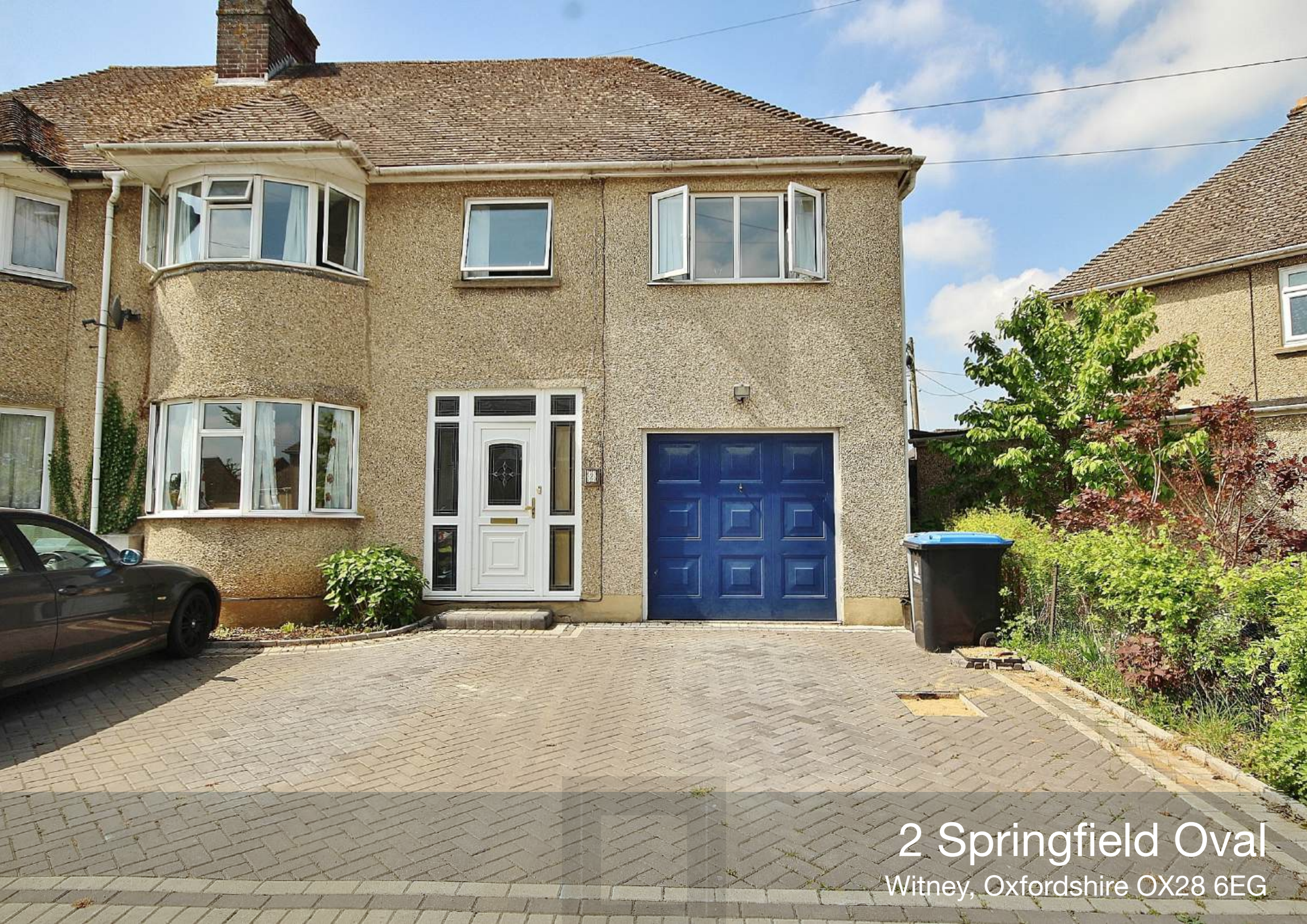
2 Springfield Oval Witney, Oxfordshire OX28 6EG