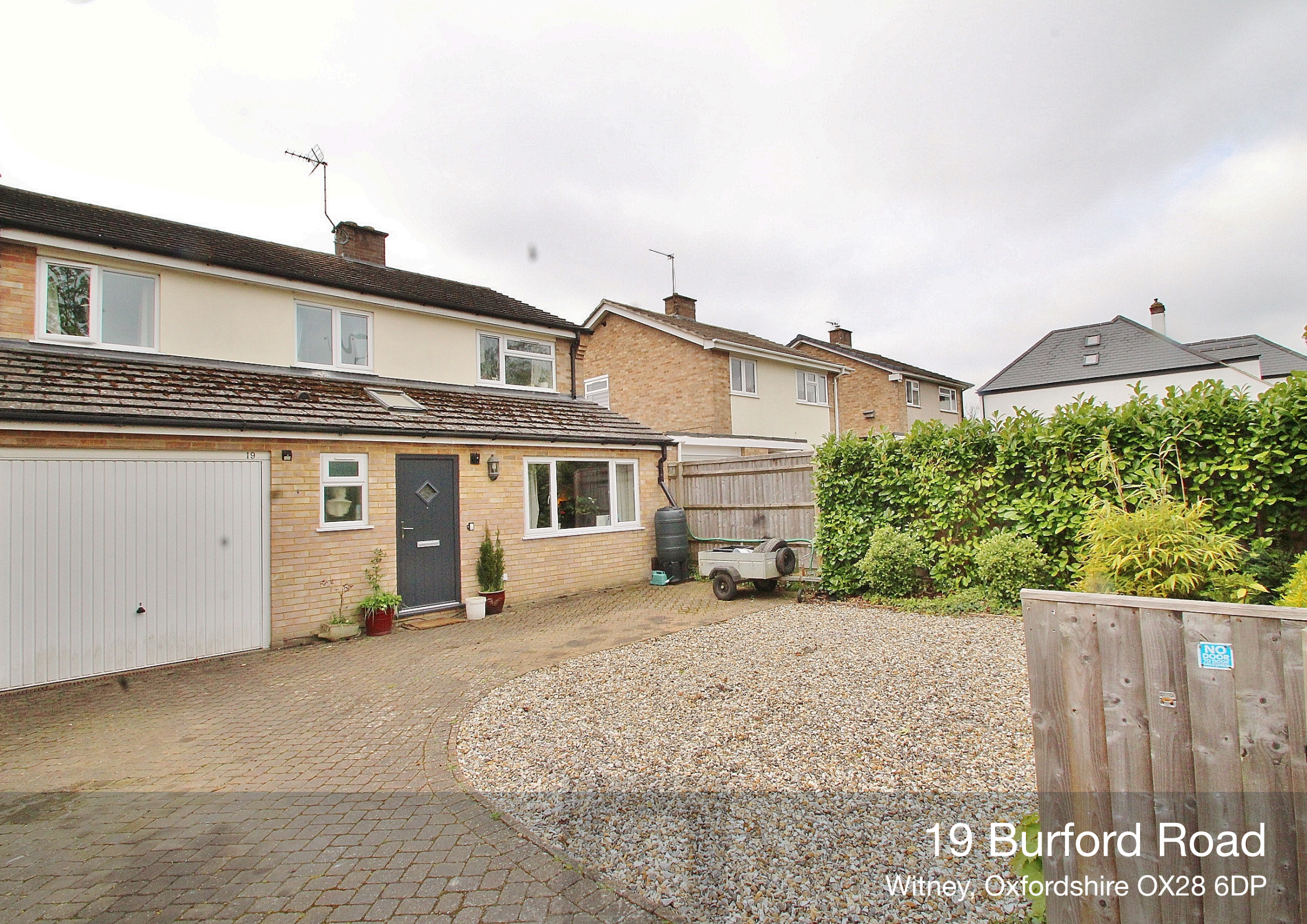
19 Burford Road Witney, Oxfordshire OX28 6DP