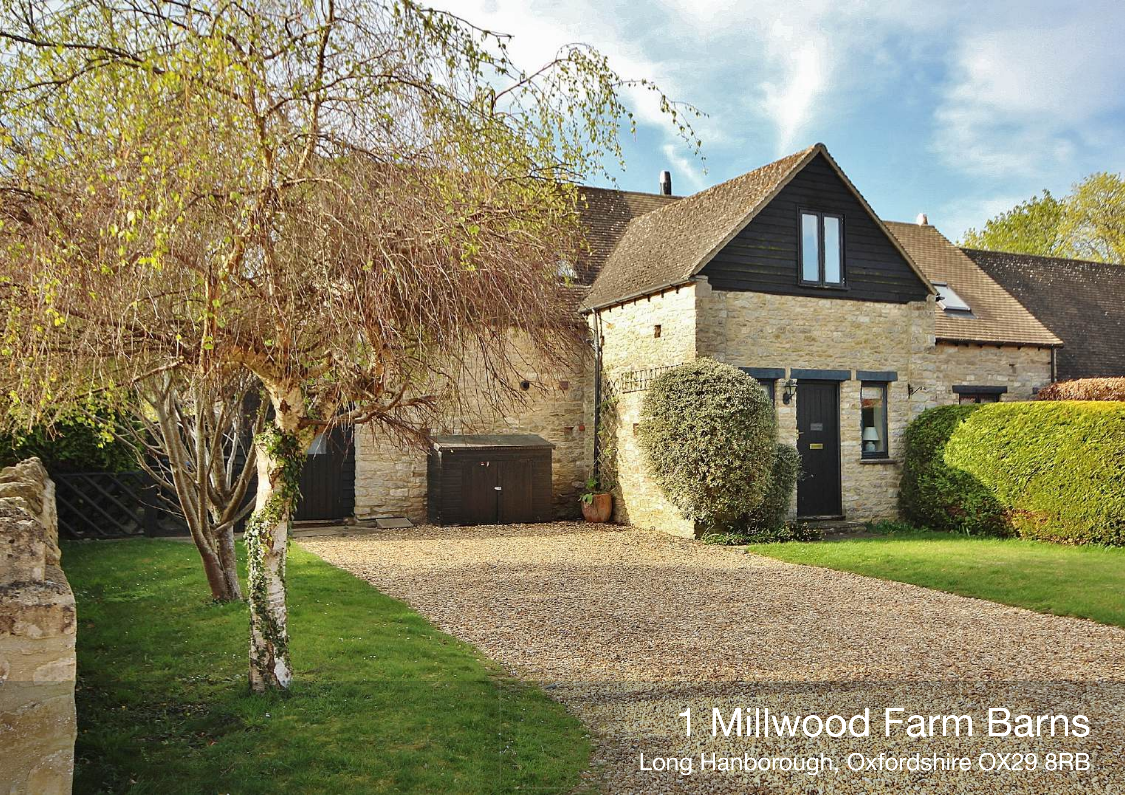
1 Millwood Farm Barns Long Hanborough, Oxfordshire OX29 8RB