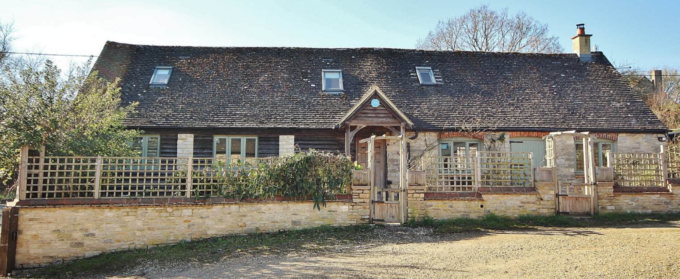
Old Stables, Oxford Hill, Witney, Oxfordshire OX29 6UT