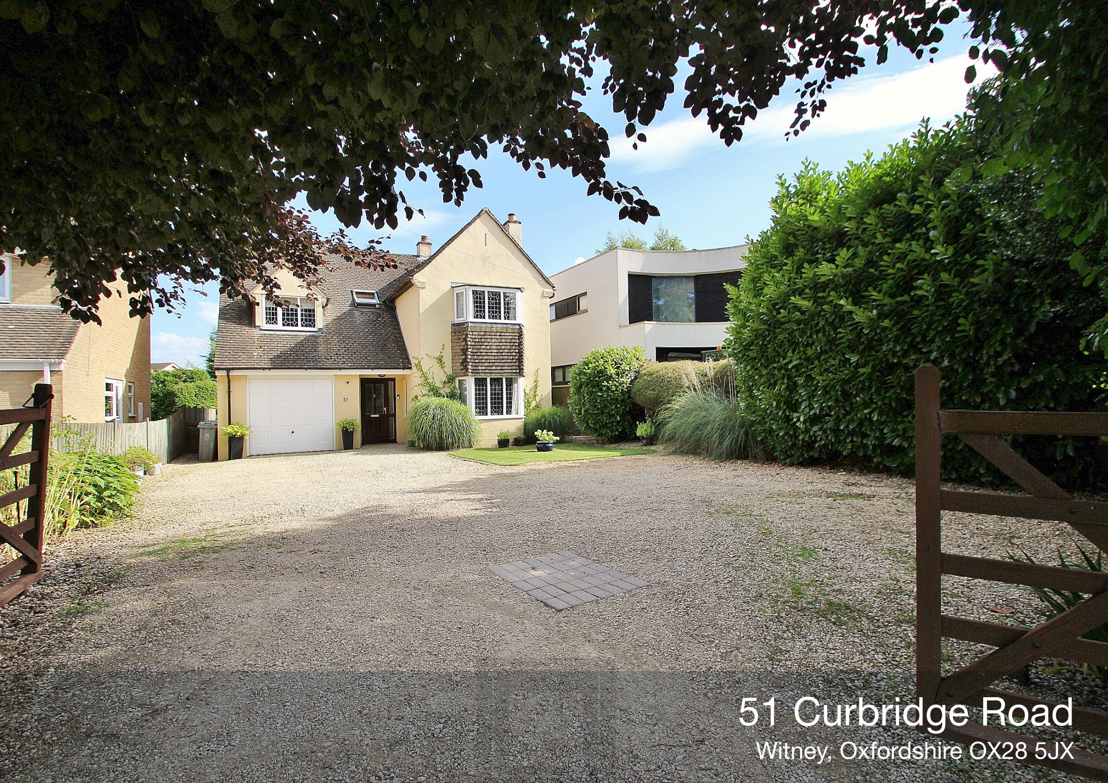
51 Curbridge Road Witney, Oxfordshire OX28 5JX