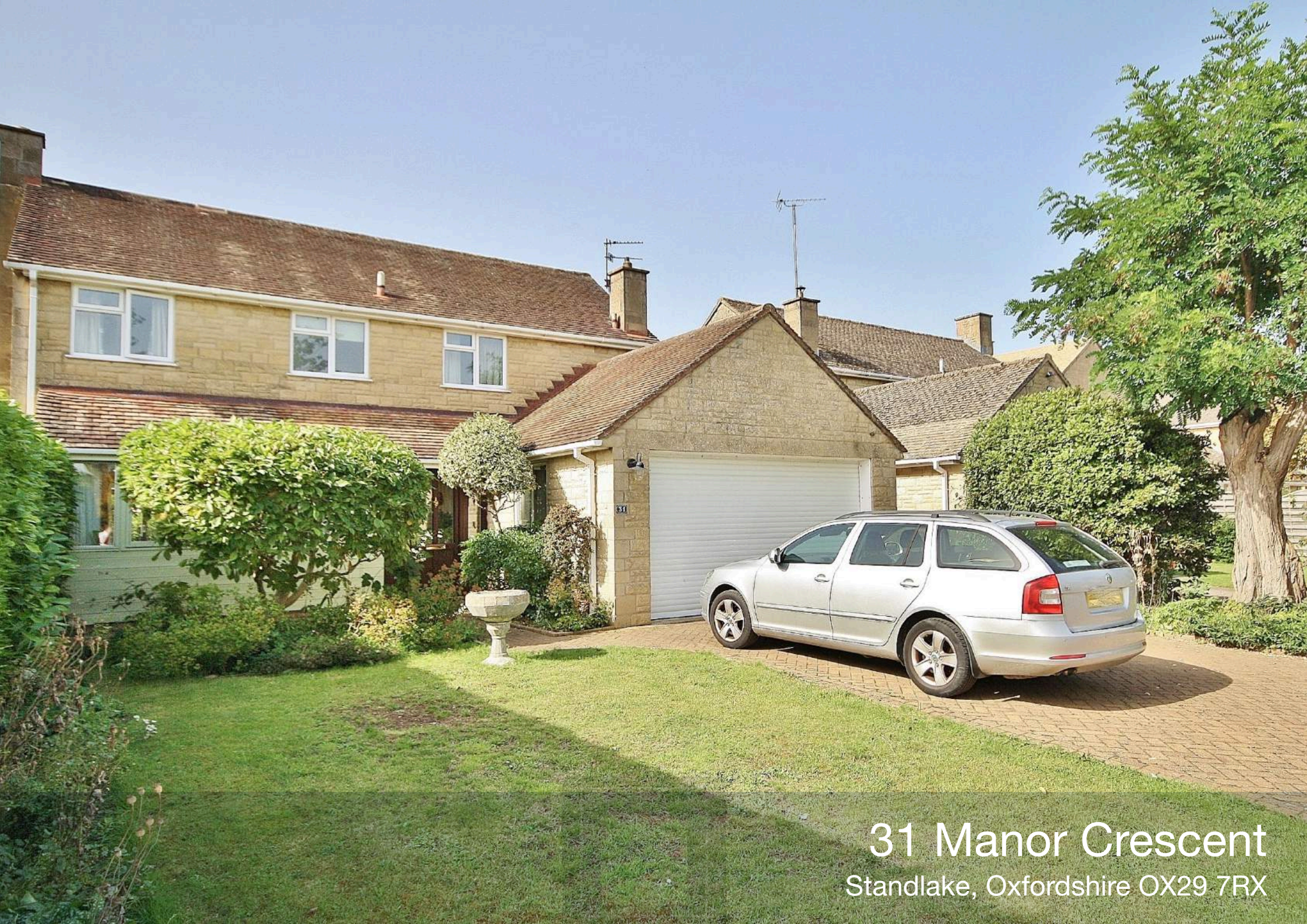
31 Manor Crescent Standlake, Oxfordshire OX29 7RX