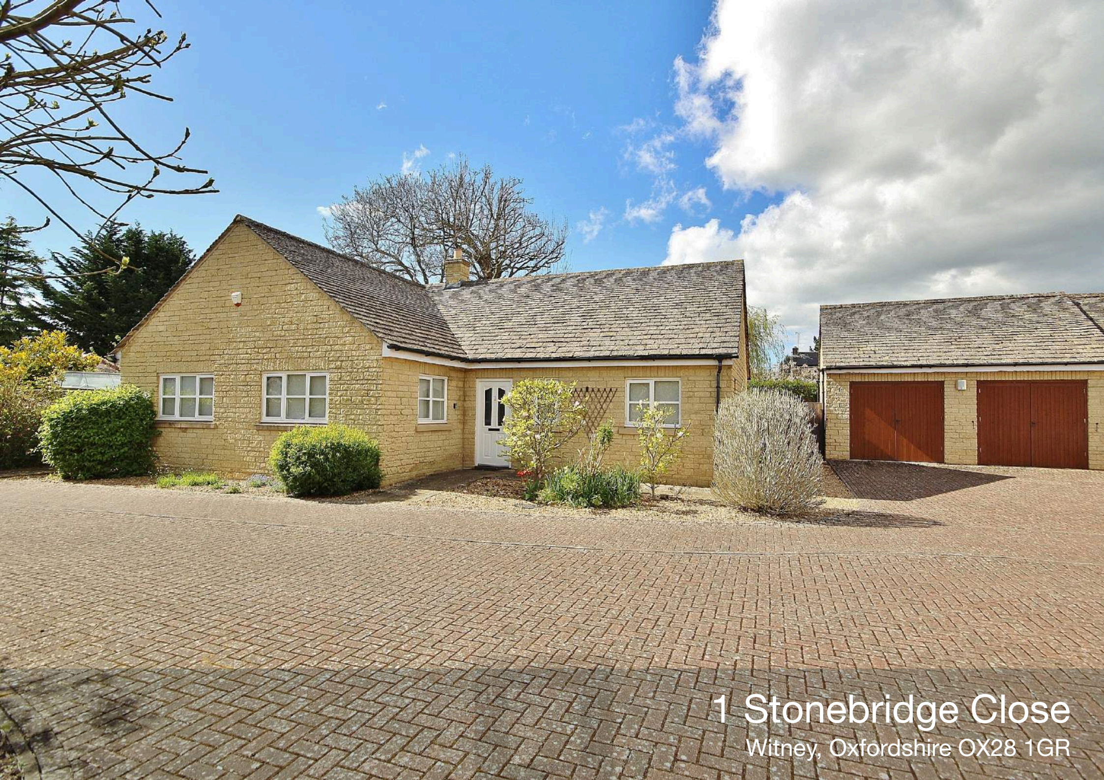
1 Stonebridge Close Witney, Oxfordshire OX28 1GR