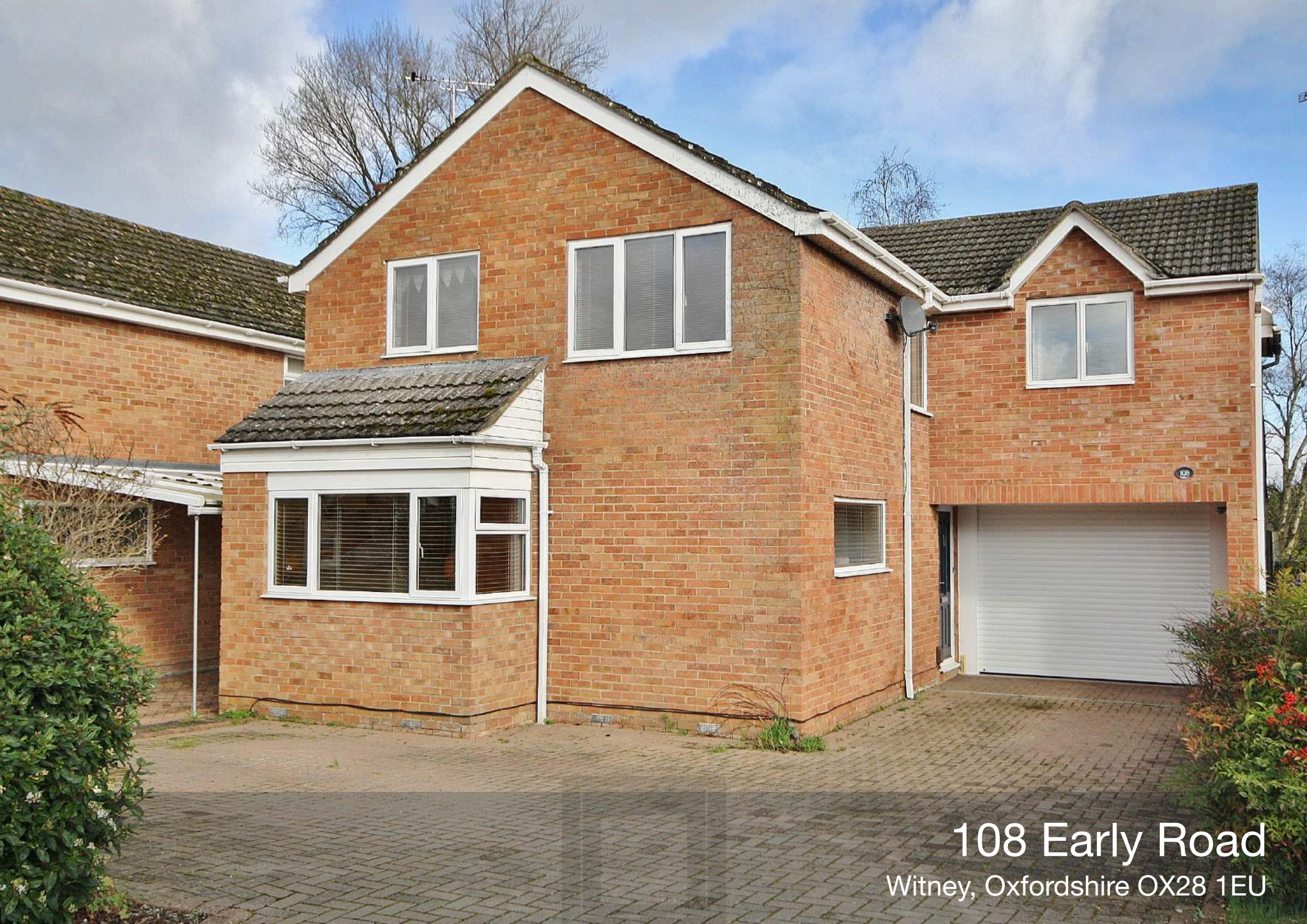
108 Early Road Witney, Oxfordshire OX28 1EU