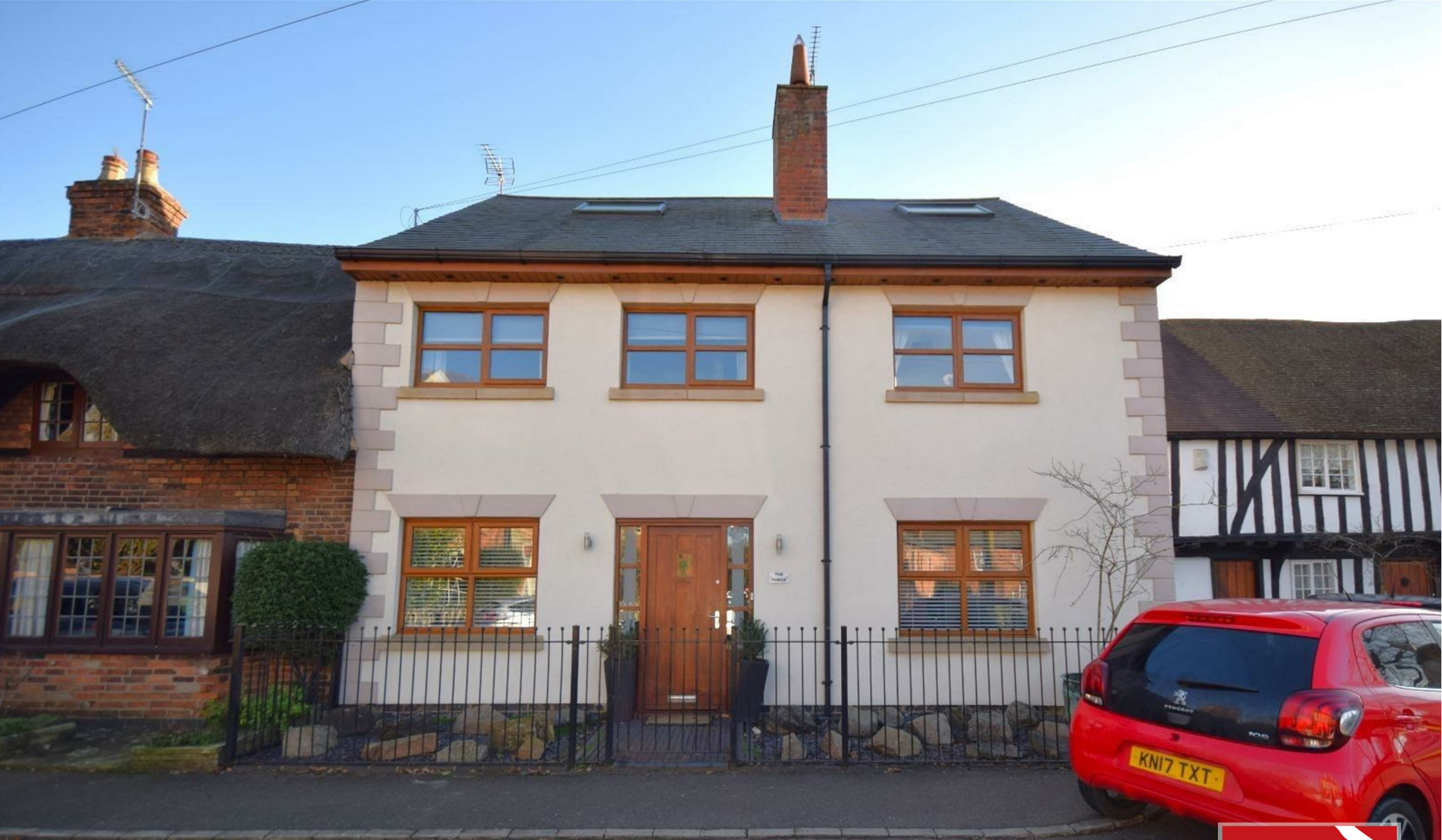
The Square, Rugby, £1,800