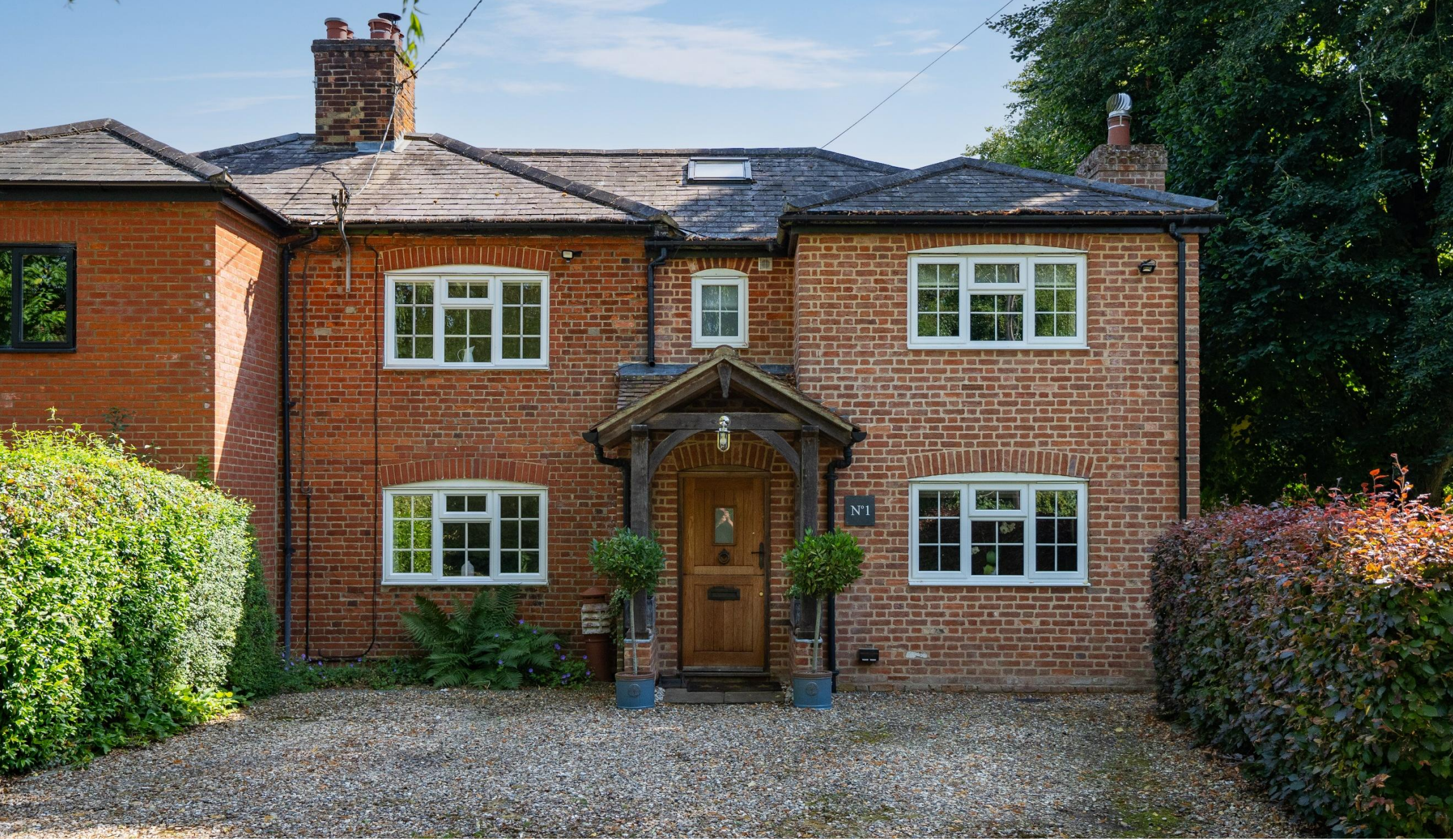
1 Brickhouse End Cottage, Berden CM23 1AZ