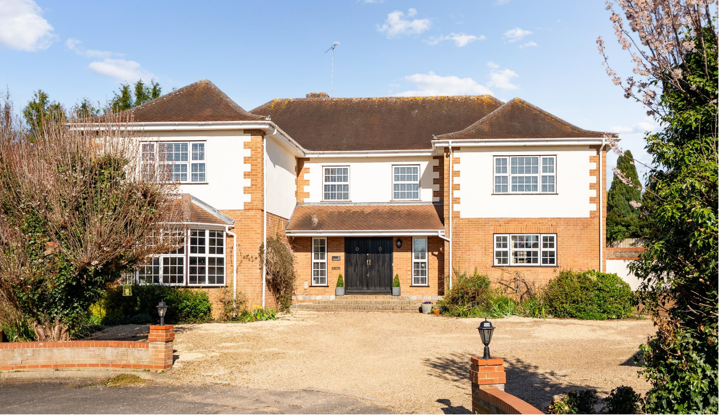
Lavenham House, 5 Clays Meadow CB11 4TX