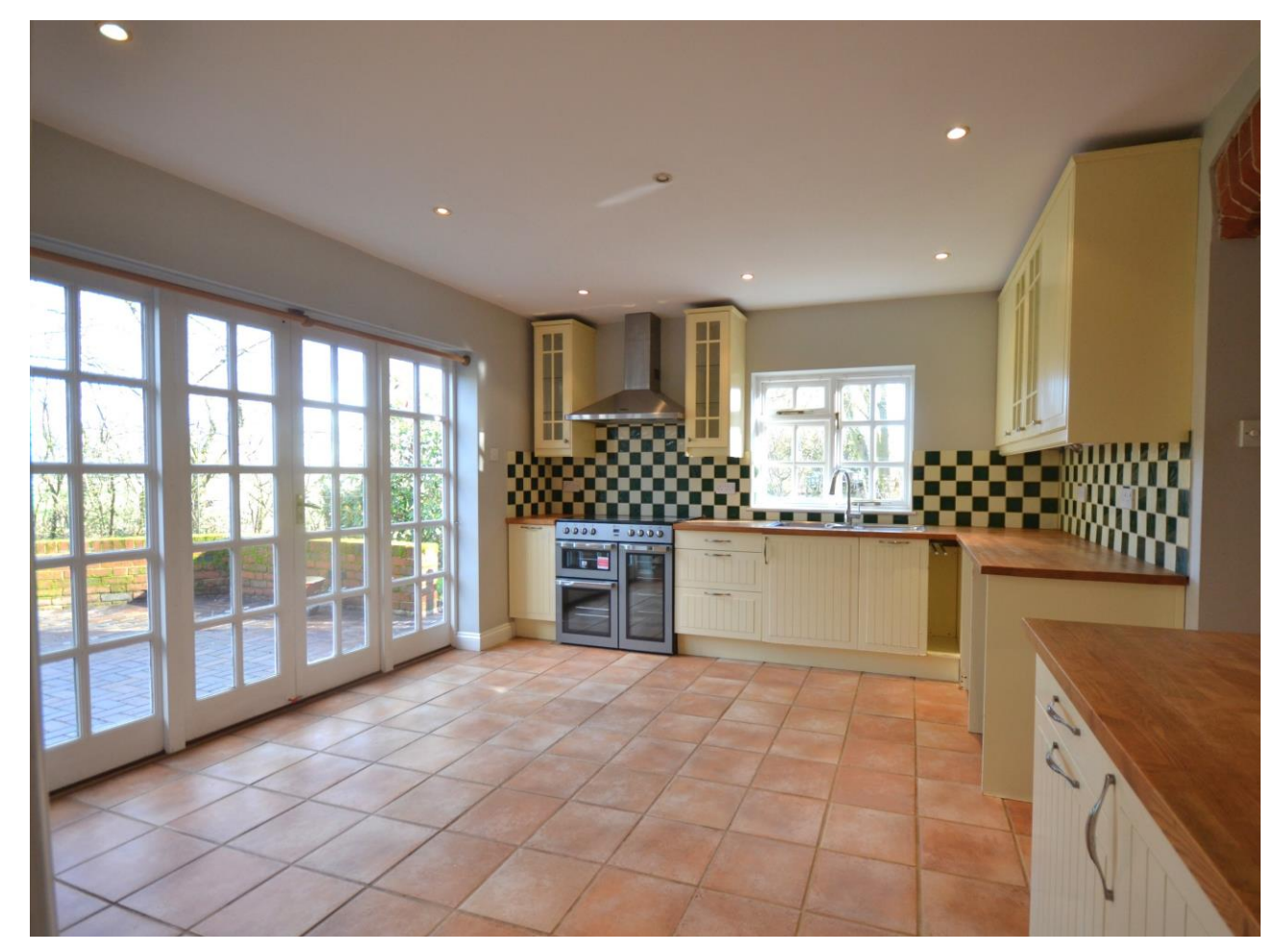
garden. There is also a utility room with base and eye level cupboards and space and plumbing for a washing machine and tumble dryer and door leading onto the rear garden.

The first-floor landing has a built-in storage cupboard housing the hot water cylinder and doors to the adjoining rooms. Bedroom one is a double room with window to front aspect and built in wardrobes and storage cupboard. Bedroom two is a dual aspect double room with views over the garden and adjoining countryside. From this room, there is access via ladder to a large, insulated loft space. A third bedroom is a good size room with window to rear aspect and feature fireplace. Bedroom four is a good size dual aspect room with built in storage and views over the adjoining countryside. The family bathroom comprises panelled bath with shower attached over, WC, hand wash basin and towel rail.