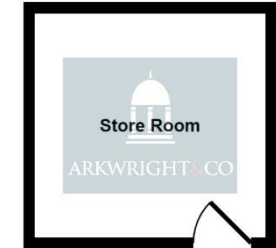
store room Approx 9 sq m / 94 sq ft

Agents Notes: All measurements are approximate and quoted in metric with imperial equivalents and for general guidance only and whilst every attempt has been made to ensure accuracy, they must not be relied on. The fixtures, fittings and appliances referred to have not been tested and therefore no guarantee can be given that they are in working order. Internal photographs are reproduced for general information and it must not be inferred that any item shown is included with the property. For a free valuation, contact the numbers listed on the brochure.