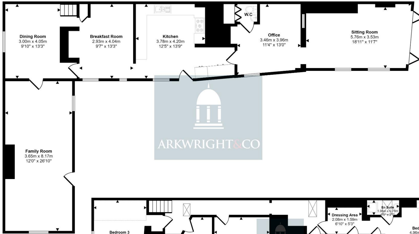
Ground Floor Approx 117 sq m / 1262 sq ft