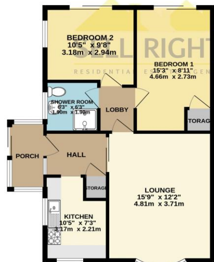
TOTAL FLOOR AREA : 807 sq.ft. (75.0 sq.m.) approx.

Whilst every attempt has been made to ensure the accuracy of the floorplan contained here, measurements of doors, windows, rooms and any other items are approximate and no responsibility is taken for any error, omission or mis-statement. This plan is for illustrative purposes only and should be used as such by any prospective purchaser. The services, systems and appliances shown have not been tested and no guarantee as to their operability or efficiency can be given. Made with Metropix ©2024