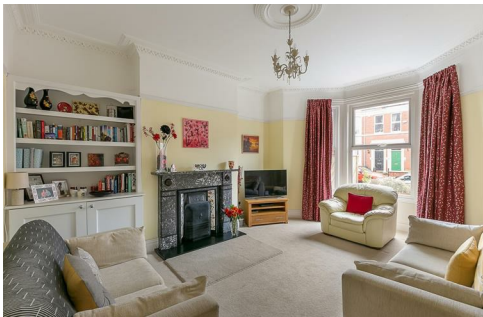
GROUND FLOOR 888 sq.ft. (82.5 sq.m.) approx.

Edwardian Terrace | 2,330 Sq ft (216.5m2) | Five Double Bedrooms | Lounge | Family Room | Kitchen Area | Ground Floor WC | Wet Room & Family Bathroom | Enclosed Rear Yard with Artificial Lawn | Central Location | EPC Rating: E