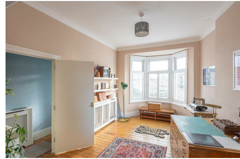
1ST FLOOR 616 sq.ft. (57.2 sq.m.) approx.