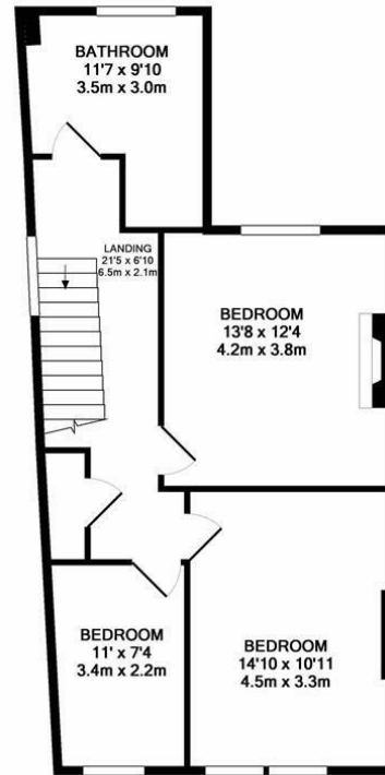
1ST FLOOR APPROX. FLOOR AREA 633 SQ.FT. (58.8 SQ.M.)