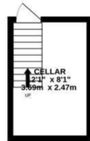
BASEMENT 98 sq.ft. (9.1 sq.m.) approx.