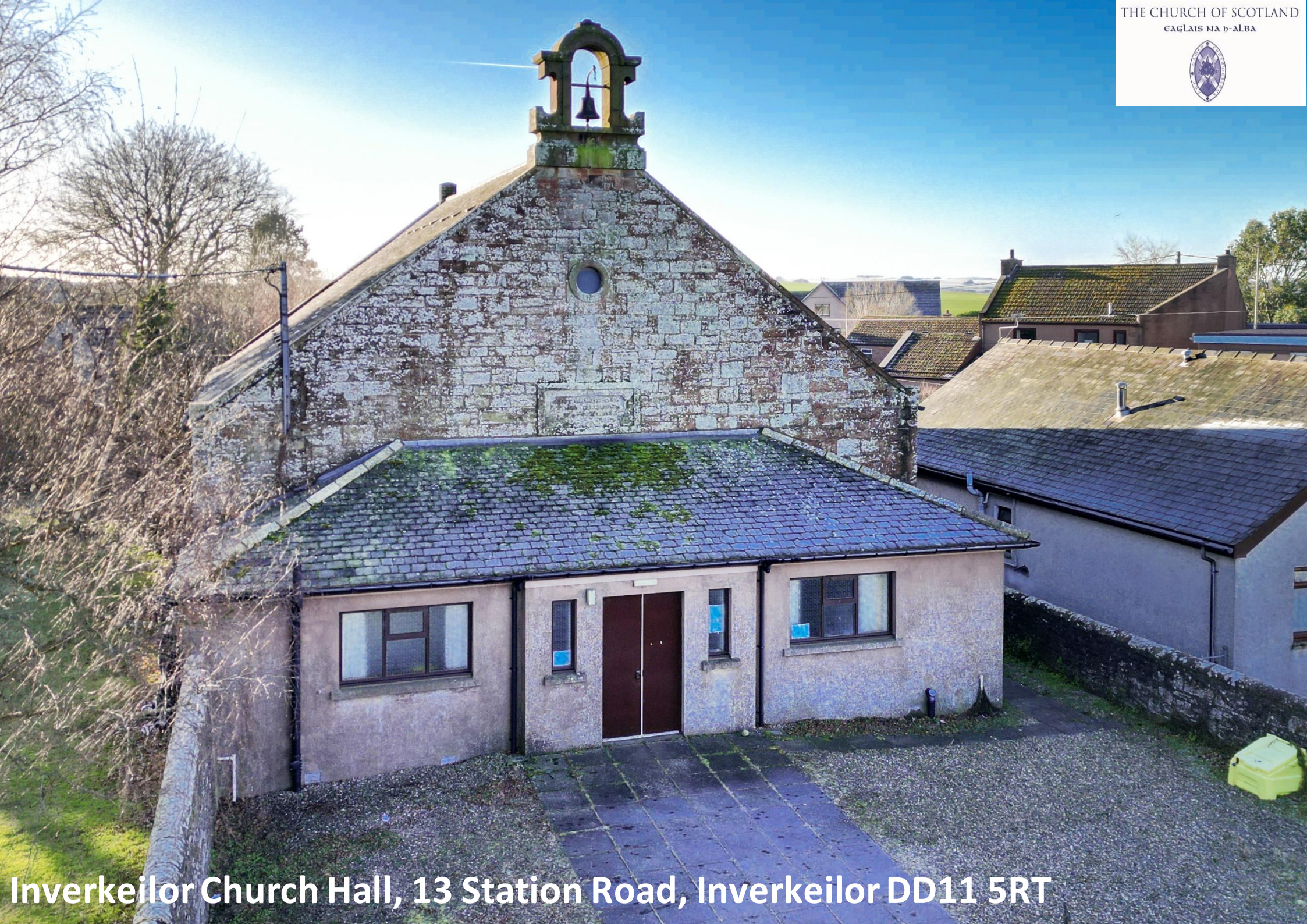
Inverkeilor Church Hall, 13 Station Road, Inverkeilor DD11 5RT