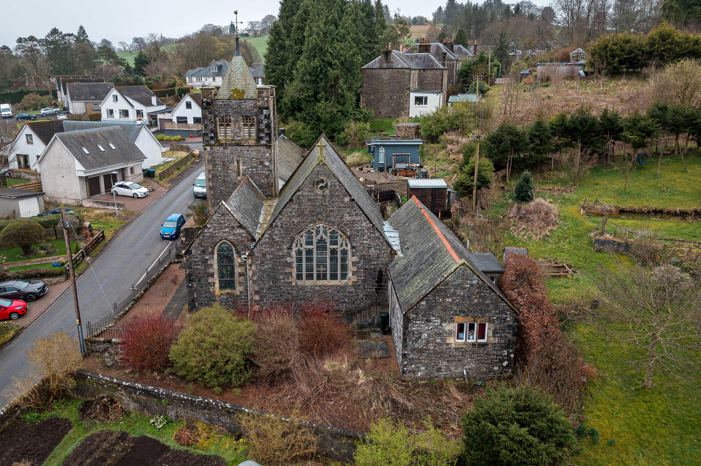
Arngask Church, Church Brae, Glenfarg, PH2 9NL