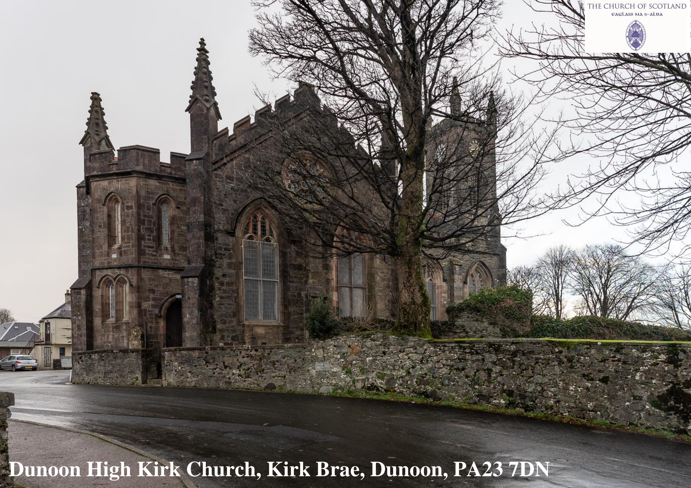
Dunoon High Kirk Church, Kirk Brae, Dunoon, PA23 7DN