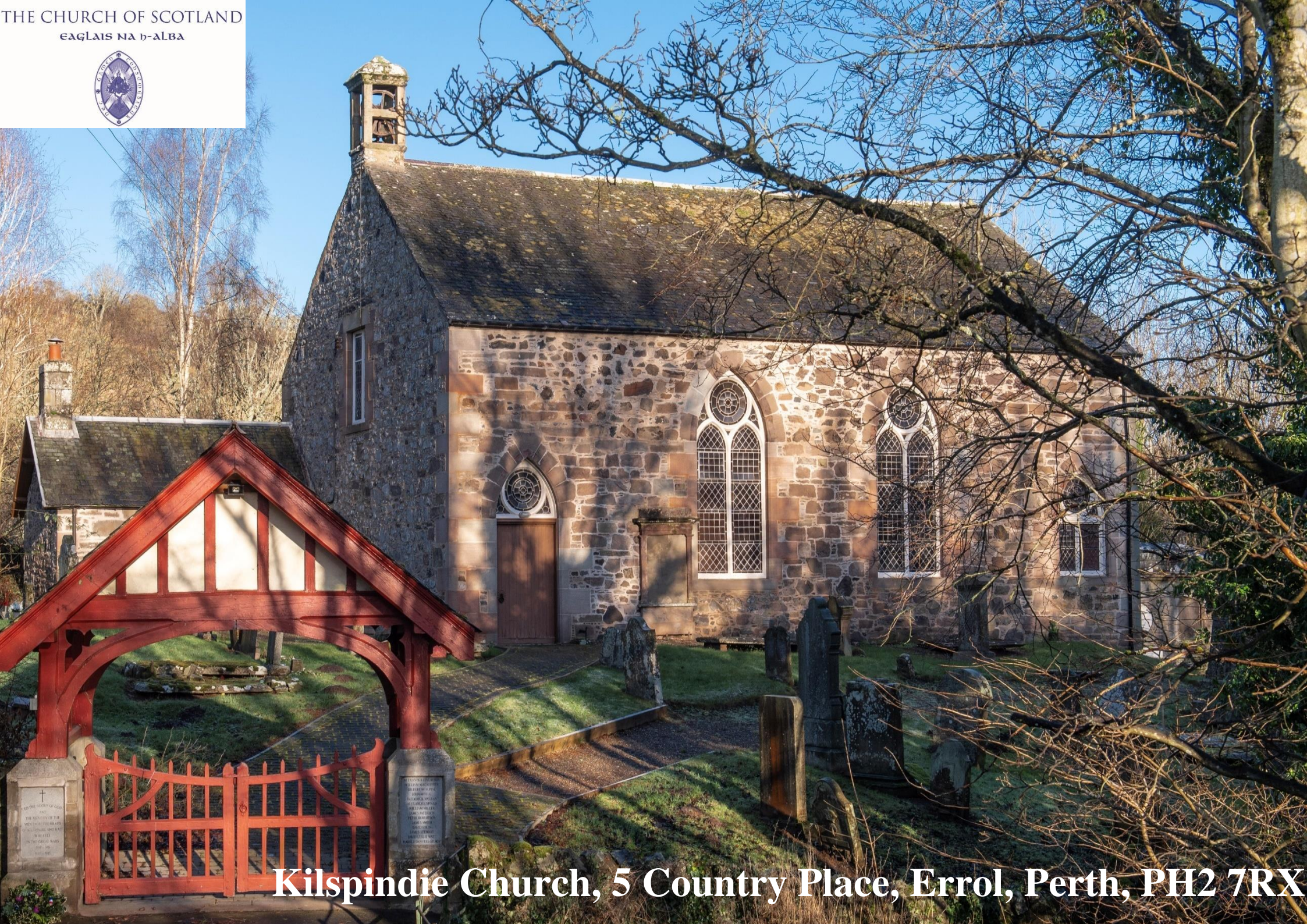
Kilspindie Church, 5 Country Place, Errol, Perth, PH2 7RX