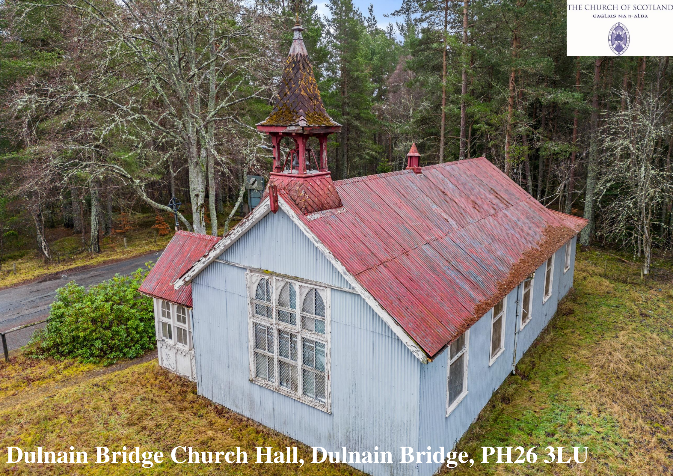
Dulnain Bridge Church Hall, Dulnain Bridge, PH26 3LU