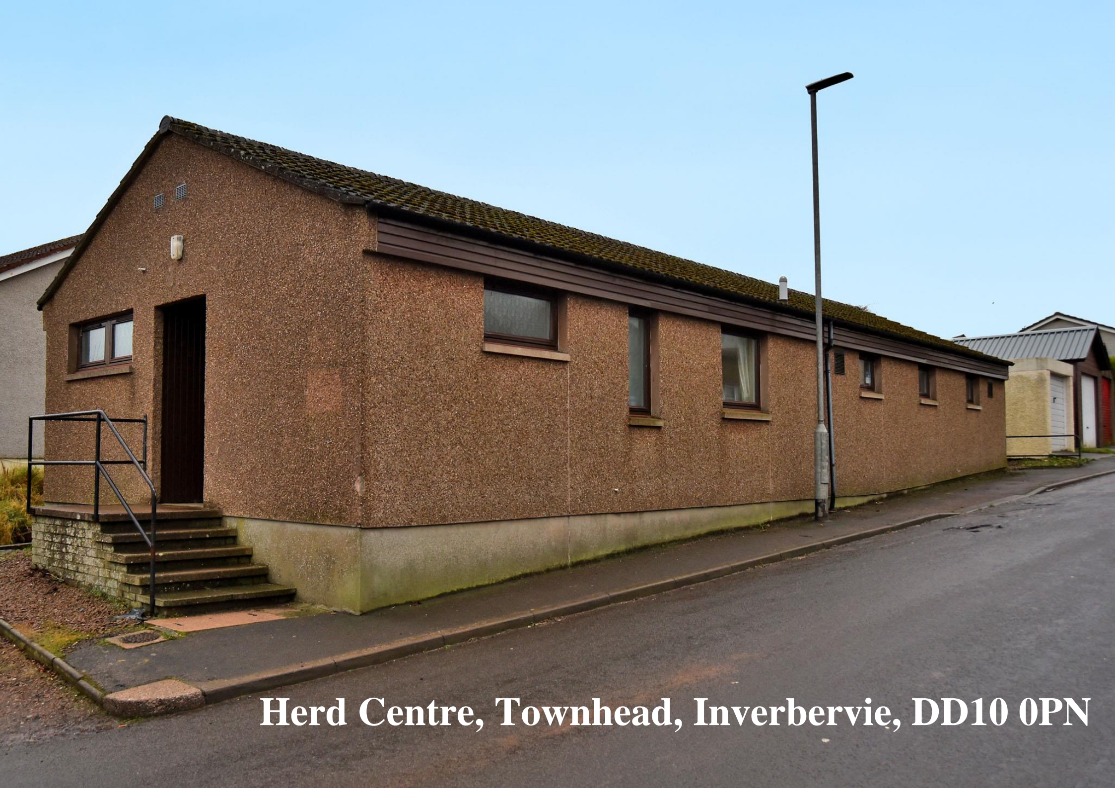
Herd Centre, Townhead, Inverbervie, DD10 0PN