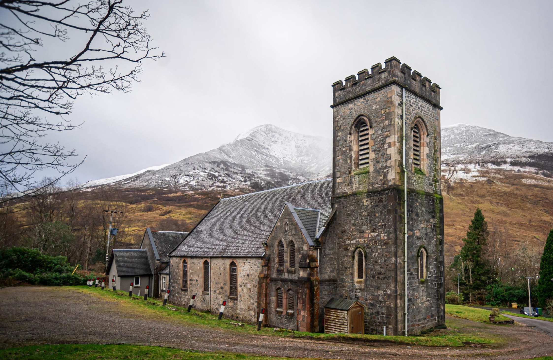
St Munda's Parish Church, Ballachulish, PH49 4JG