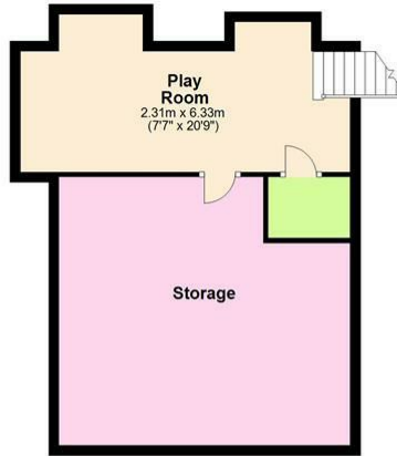
Basement Approx. 21.7 sq. metres (233.1 sq. feet)