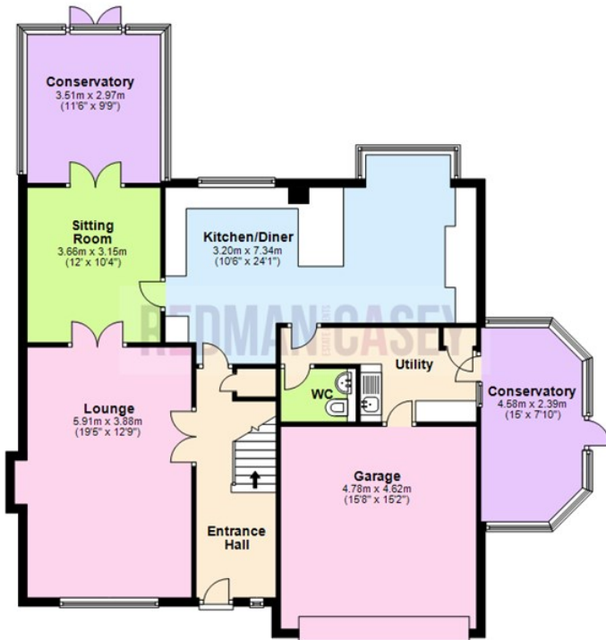
Ground Floor Approx. 104.5 sq. metres (1125.4 sq. feet)