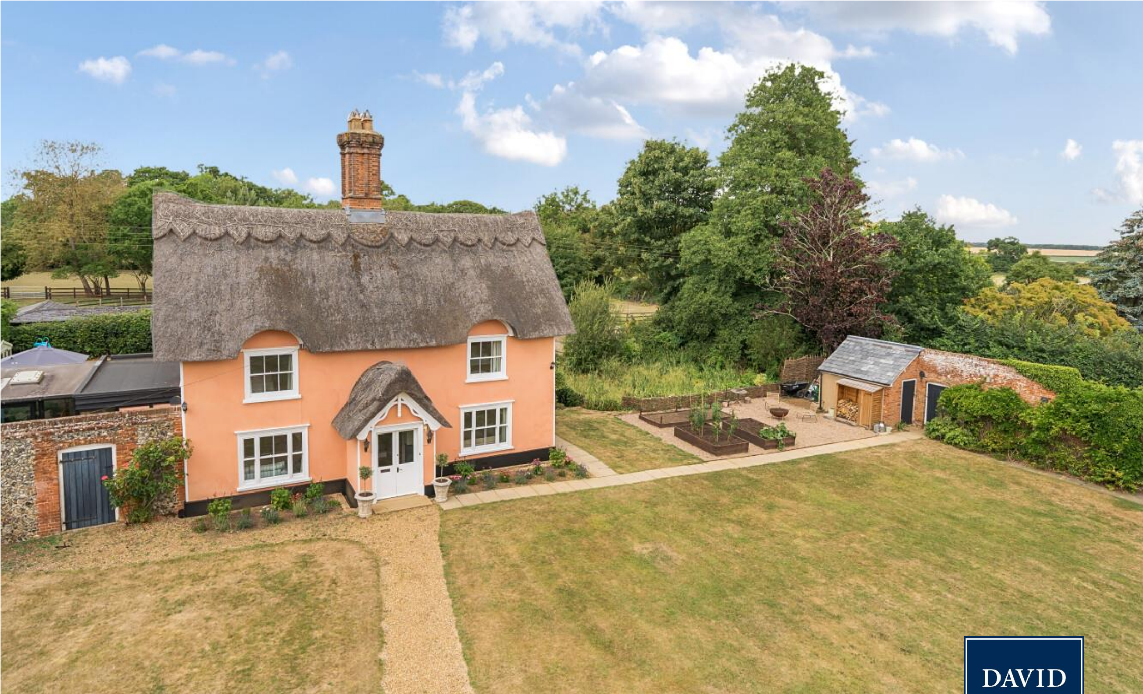
The Cottage, Horringer, Suffolk.