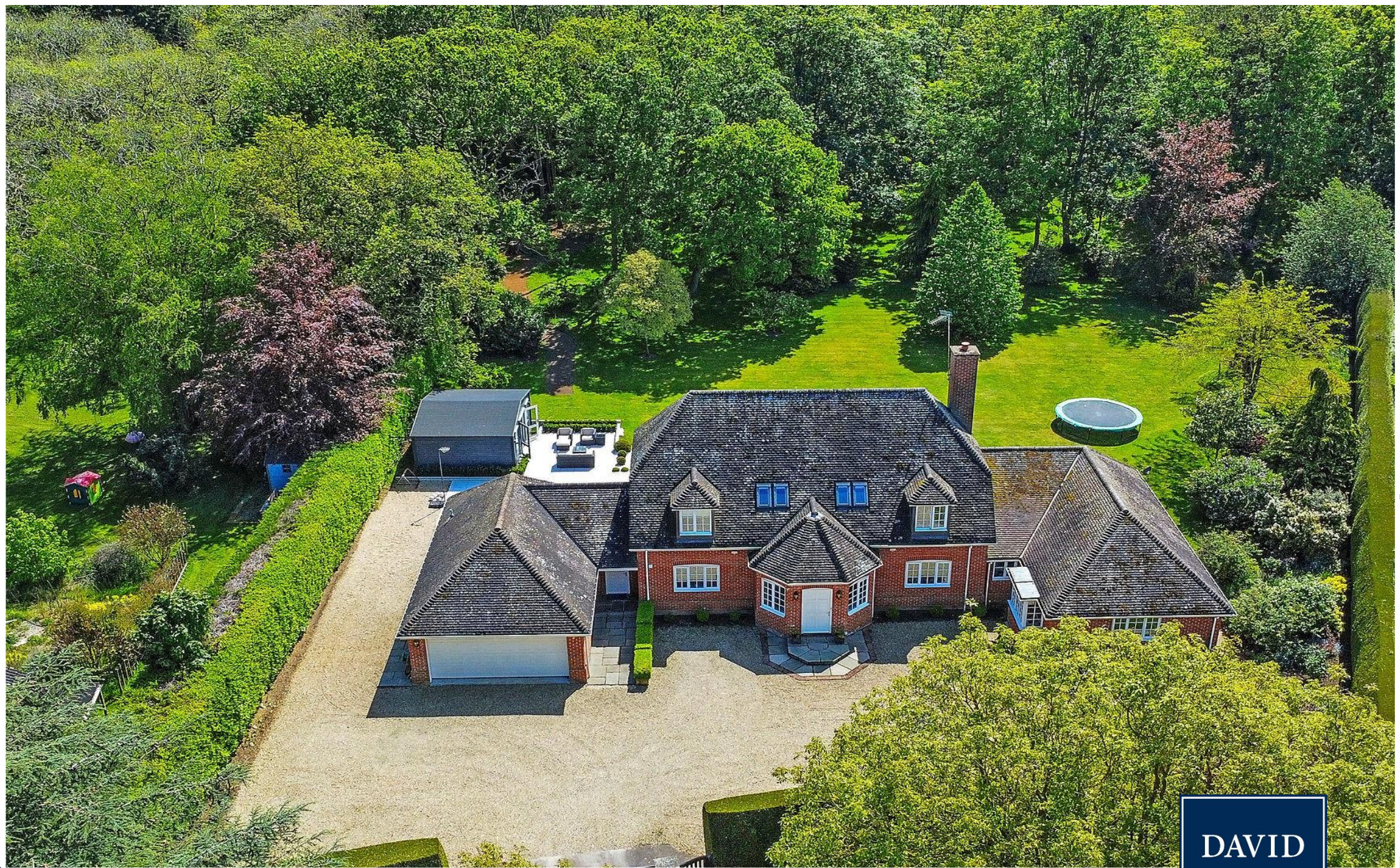
Parklands House, Fornham St. Genevieve, Bury St. Edmunds, Suffolk.