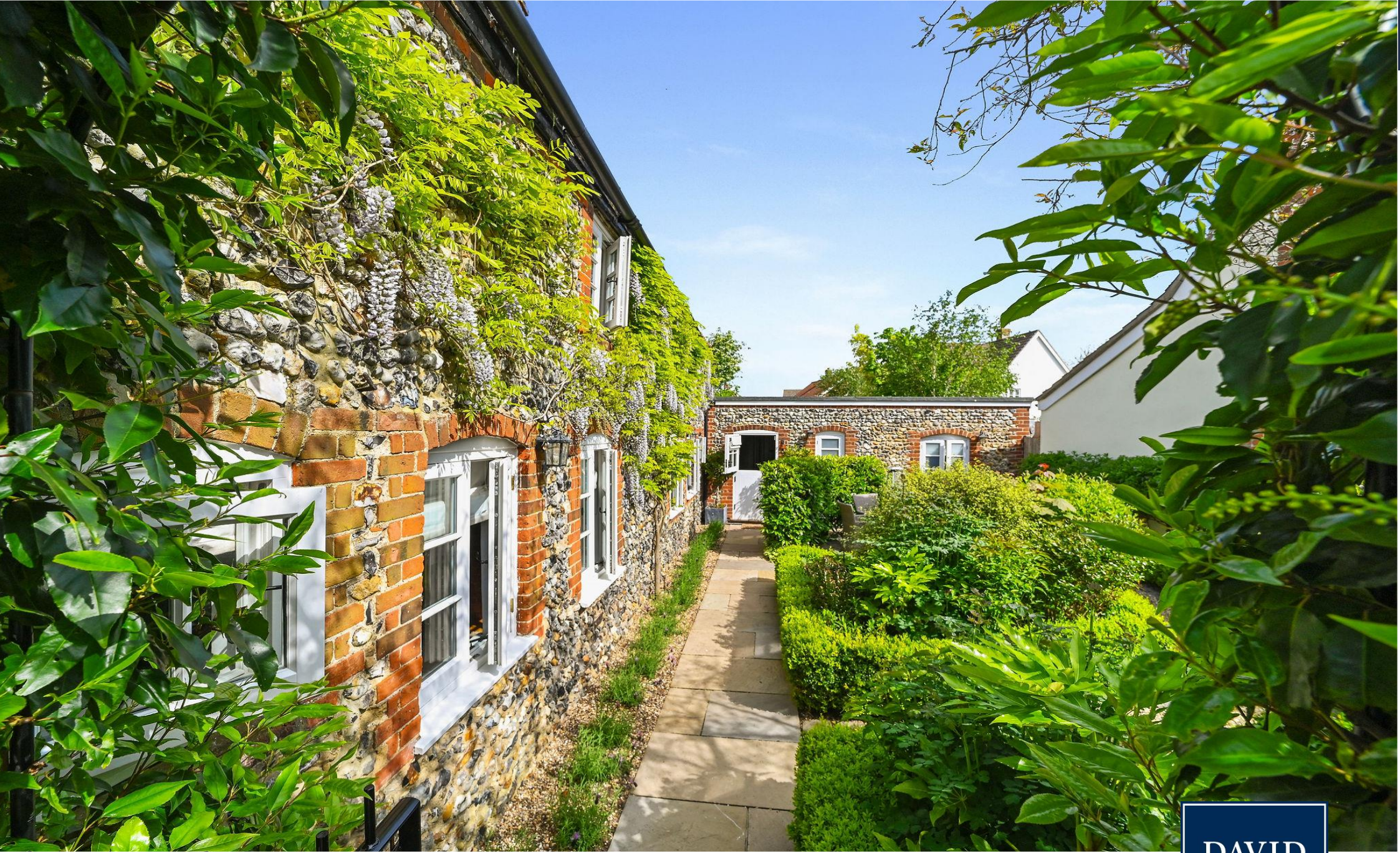
Dove Cottage, Barrow, Bury St. Edmunds, Suffolk.