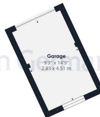
Ground Floor Building 3