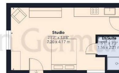
Floor 1 Building 2

Approximate total area m 4020.76 ft 2 373.54 m 2