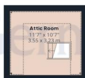
Floor 3 Building 1