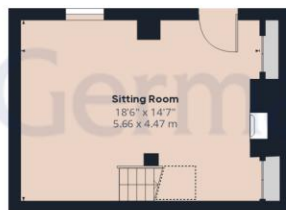
Floor -1 Building 1