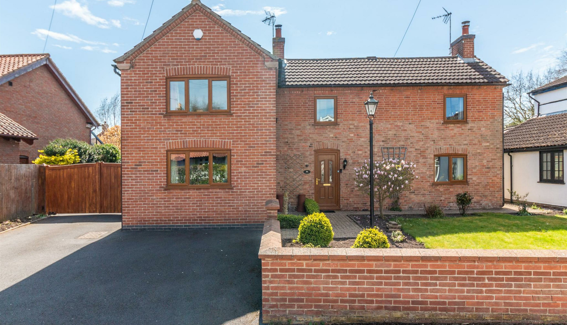
Spring Cottage, 4 Morkinshire Lane, Cotgrave, NG12 3HJ