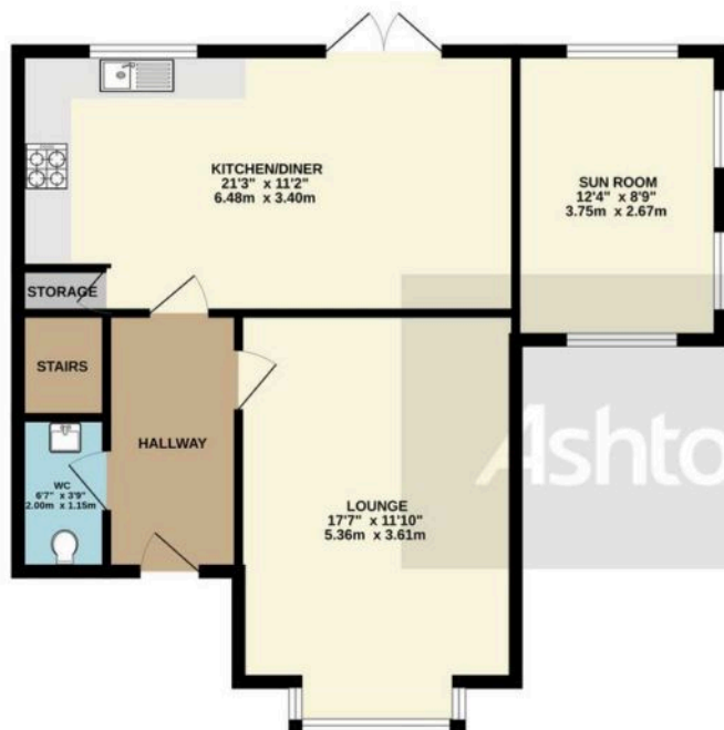
GROUND FLOOR 648 sq.ft. (60.2 sq.m.) approx.